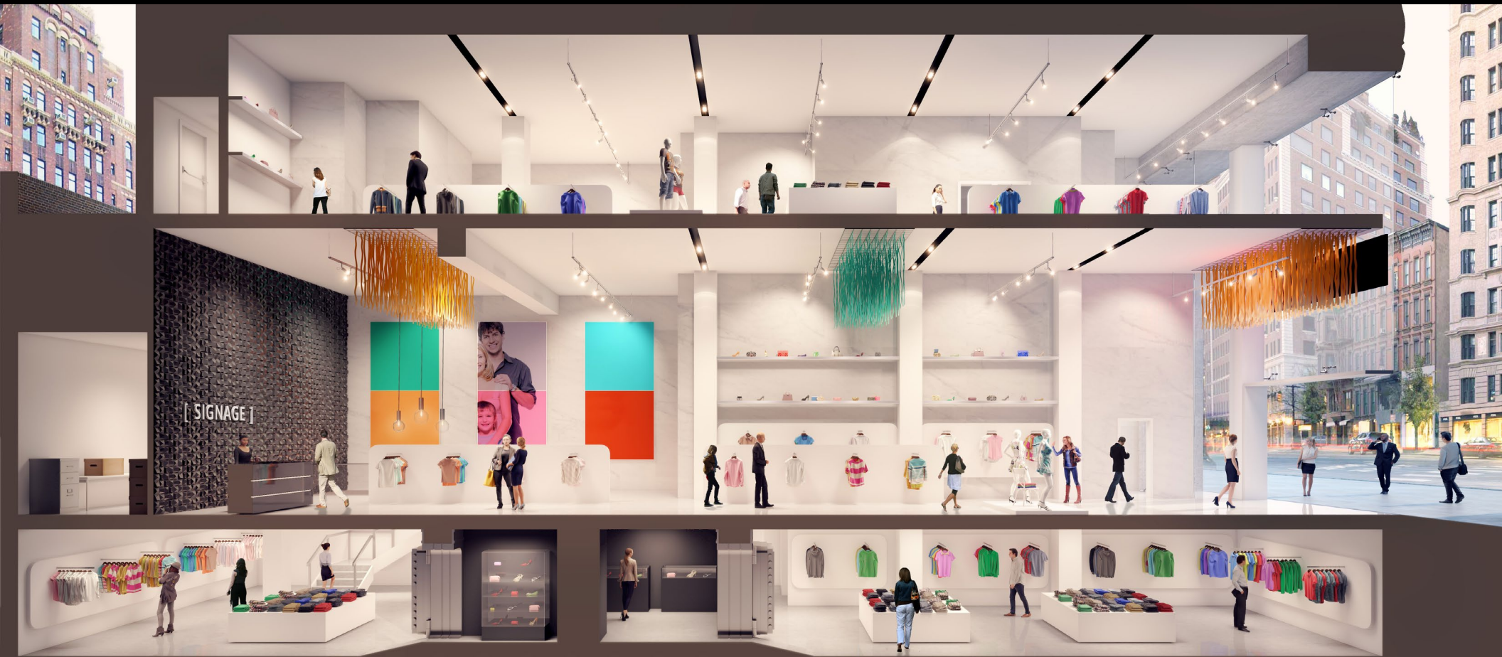
Triplex retail sectional view